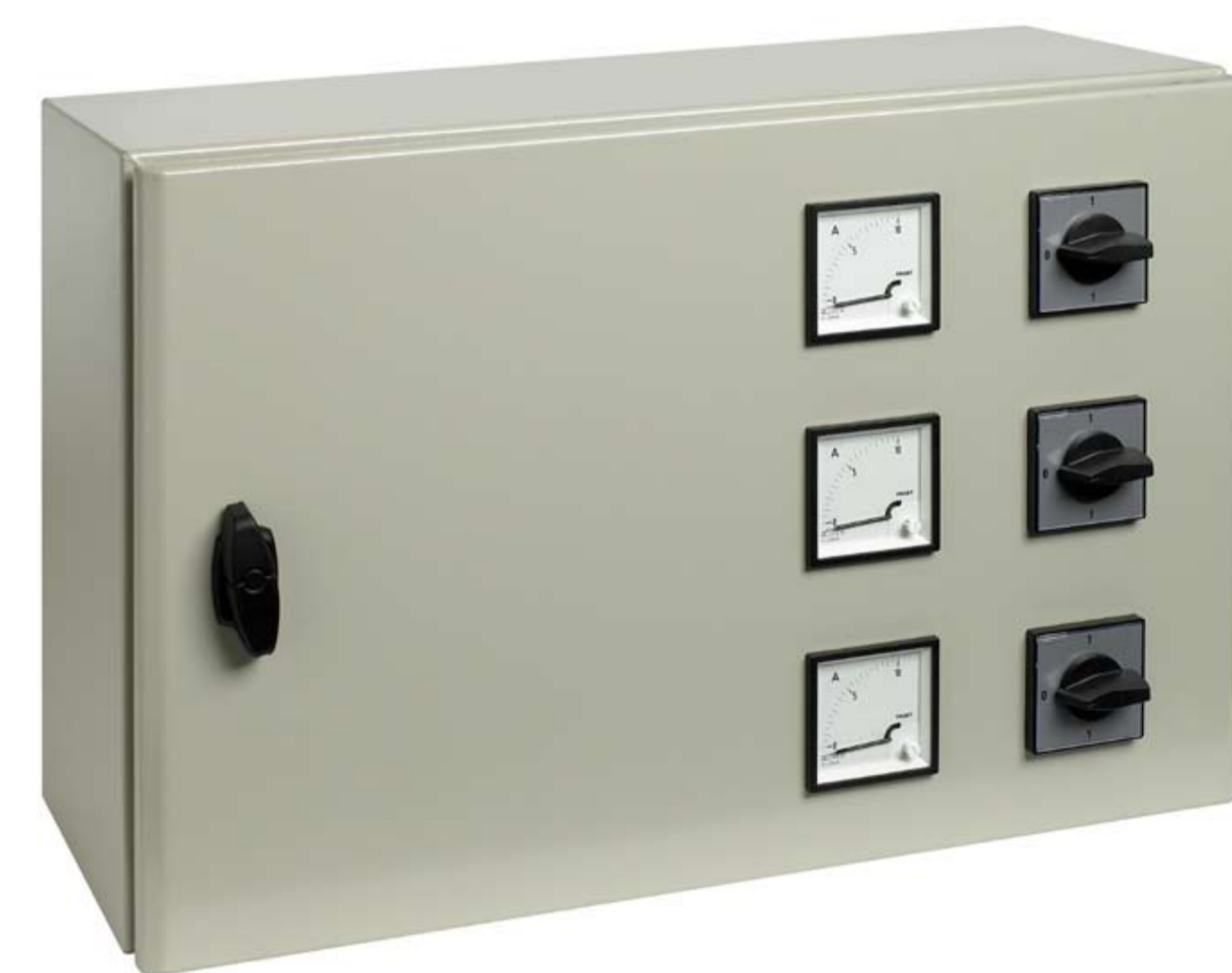
Junction box with three 40 A / 900VDC/ 2P switches, with analog current measurement Suitable for an installation with three inverters.

Haven't you seen the junction box that meets your installation needs?... Just let us know your requirements, and we'll make it for you.