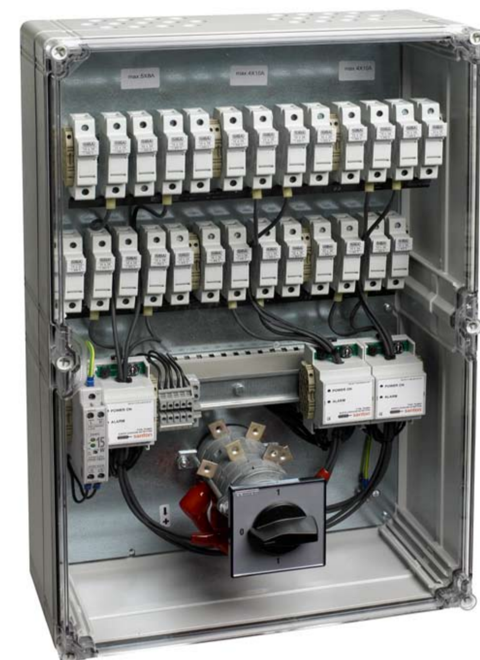
Santon junction box 40A/900VDC/ 6P With fuse protection in both poles and earth fault detection. Suitable for a 33kW multistring inverter