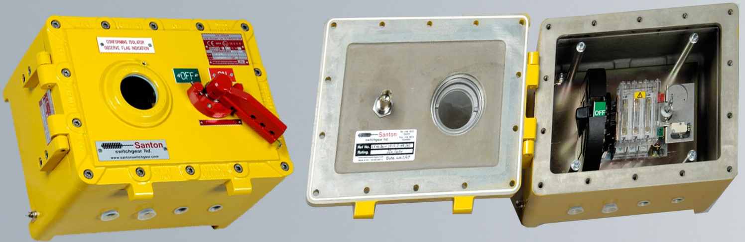
32A Isolator for EExd / ATEX hazardous areas.